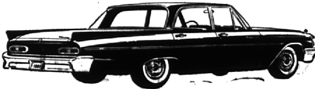
Mercury Meteor 600 4-door Sedan

SEE BOB FROST INVITES YOU TO & THE DAZZLINGLY NEW DRIVE MERCURY METEOR 600 & 800 SERIES FOR 1961!