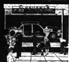
See the "inside story" of the new F-85! Full-size "cut-away" model of the new F-85 graphically illustrates why it's every inch an Oldsmobile.