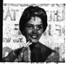
MEET MISS AMERICA WHEN SHE VISITS THE OLDS EXHIBIT SATURDAY AND SUNDAY OCTOBER 15 & 16

VISIT THE OLDS EXHIBIT AT THE "NATIONAL AUTO SHOW"... COBO HALL... OCT. 15-23