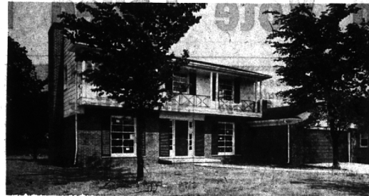
ALWAYS IN GOOD TASTE!

WOOD CREEK FARMS—The council acknowledged receipt, at last week's meeting, of plans for proposed gas lines to be installed in the future by Consumers power company.