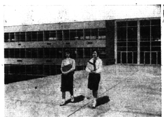
Michigan's school system ranks with the best in the country. Taxes paid by businesses such as Standard Oil could go to no finer purpose than helping pay the cost of education. The new Ferndale High School is a shining example of a tax at work.

What is the biggest advantage of living in Michigan?