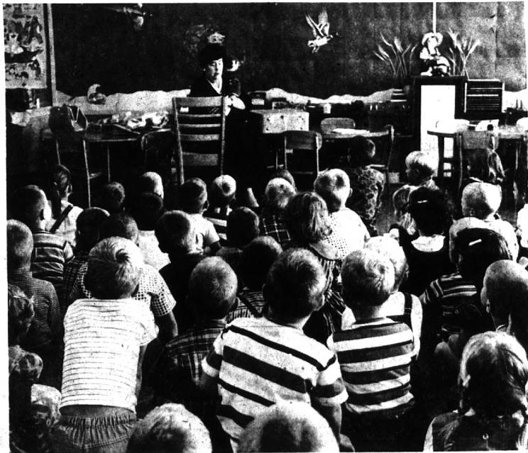
And from the looks of this intent young audience, the clever presentation got results. "Thank you very much," concluded the program.