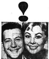
UNITED STATES BREWERS FOUNDATION

THE DONALD O'CONNOR SHOW STARRING DONALD O'CONNOR MITZI GAYNOR CO-STARRING ANDRE PREVIN WITH SIDNEY MILLER