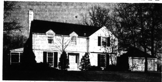
RIVER AND VALLEY VIEW!

There are still 15 million households in the United States without an automobile.