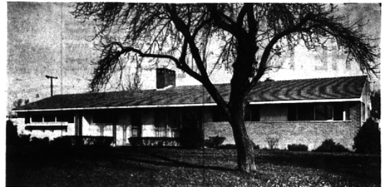
STUNNING — AND BARGAIN PRICED!

Enjoy the scenic woodland vista to a sparkling stream in the valley below. 4 bedrooms, 2 1/2 family baths, plus library. On the lower level is a den or maid's room with full bath and an activities room with fireplace. Added features: newly decorated, new carpets, aluminum siding above white brick, delightful kitchen & screened porch. Top Franklin location — better call now for details — $44,900.