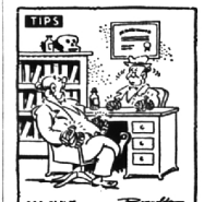
"I was all thumbs too — until I got a power tool with a Wand Ad!"

If you have room with ceilings that are too low, here is a suggestion for correcting the problem. Panel the room with vertical panel boards of soft-grained Douglas fir or west coast hemlock. Be sure the panel boards have a definite pronounced pattern to give added emphasis to the vertical lines and this will have the effect of raising the height of the room.