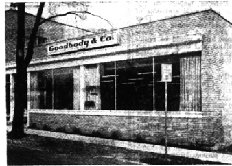
Convenient location at the corner of Bates and Martin Streets