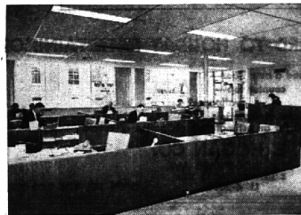
The spacious, comfortable modern interior of new Birmingham office

DON'T JUST READ THIS AD... come out and see all the wonderful Toys, Christmas Decorations, Imports, before the frantic Christmas hunting season opens.