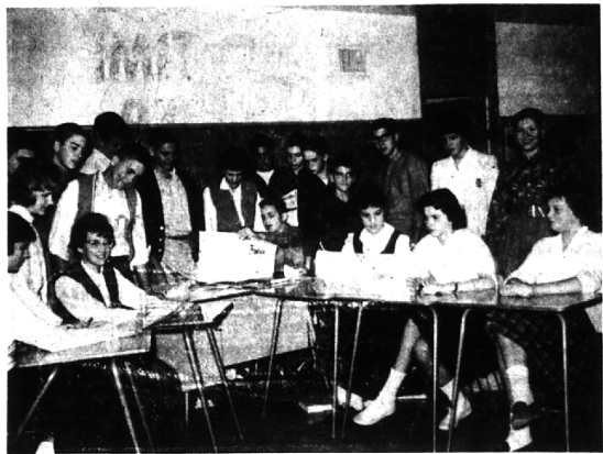
Bloomfield Hills junior high students are greatly impressed by their school paper, The Sentinel, which has graduated from mimeograph to "real" print.