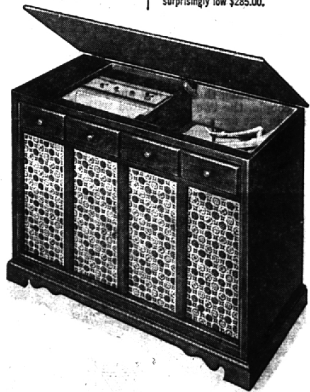
EARLY AMERICAN STEREO PHONOGRAPH (model SP-936). Finishes Cherry, maple. From $345.00

Every Stromberg-Carlson console is assembled from the identical components that hi-fi enthusiasts choose for their custom-built stereo rigs. Only Stromberg-Carlson offers energy isolation of speaker systems to permit full bass response. Prices start at a surprisingly low $285.00.