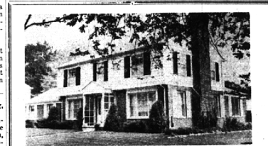
BLOOMFIELD VILLAGE 8 Room center hall colonial. Attractive established residential zoned neighborhood. Nearby stores, schools, churches. Walking distance Quanton Grade — Seaholm High Schools. No growing plants. Sewers, water, sidewalks, paved streets, other necessary services, family room first floor, all electric kitchen, 2 1/2 baths, 2 1/2 car garage. Large landscaped lot, easily maintained. Owner. MI 6-9284

WEST BLOOMFIELD — Payments for use of the Farmington interceptor sewage system by West Bloomfield residents were set at a meeting of the township board last week. Owners of residences built before April, 1959, may pay the tap-in privilege fee of $250 in 10 yearly installments. The first $25 payment is due with issuance of connection permits. ensuing payments are due July 1 each of the following nine years. Three separate flowage charges were set by the board. Homes without water meters will pay a quarterly charge of $6. Homes with water meters will be charged on meter readings, with a $6 minimum charge. Multiple developments with a master meter will be charged on meter reading, apportioned to individual users on the basis of units. ANY FLOWAGE charges not paid in 90 days will be charged an additional five per cent. This amount then become a lien against the property if not paid within 60 days.