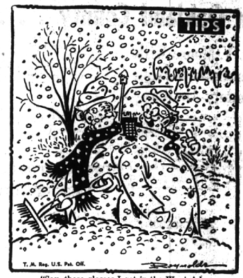
T. J. M. Reg. U.S. Pat. Off.

"Say, these glasses I got in the Want Ads are working already — the black spots have turned white!"