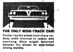
THE ONLY WIDE-TRACK CAR! Pontiac has the widest track of any car. Body width trimmed to reduce side overhang. More weight balanced between the wheels for sure-footed driving stability.

PONTIAC '61 - IT'S ALL PONTIAC! SEE YOUR LOCAL AUTHORIZED PONTIAC DEALER WILSON PONTIAC-CADILLAC, INC. 1350 N. WOODWARD BIRMINGHAM