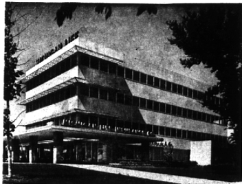
Woodward near 13 Mile

MICHIGAN LIFE is very proud that it has become an important addition to the business, economic and social life of South Oakland County since moving here five years ago on Nov. 11.