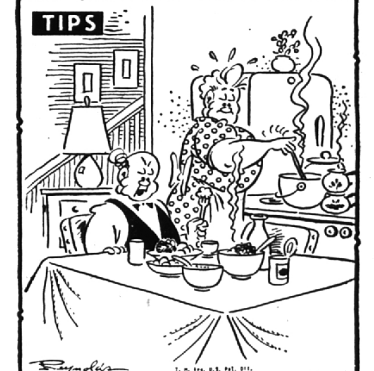
"Looks like the garbage disposal we got in the Eccentric Want Ads—is going to get a good workout tonight!"