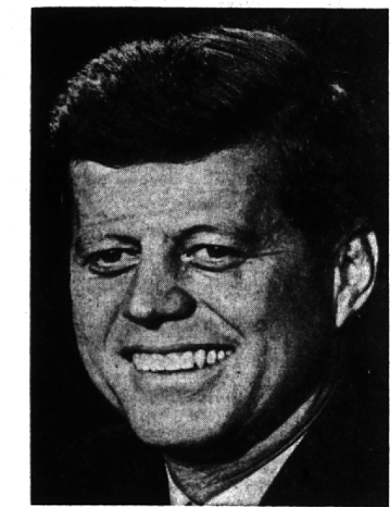
PRESIDENT-ELECT JOHN F. KENNEDY