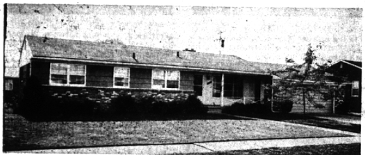
FRIENDLY AND INVITING

Built in 1952 by the present owner who is leaving Michigan. On a high and scenic site, we estimate reproduction cost at near $100,000. There is no comparable value in this entire area at $57,750. May we suggest an early inspection that you may judge for yourself?