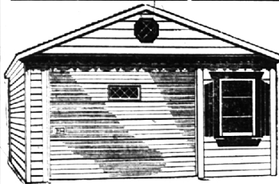
14 x 20 Economy Model

OFFERS THE LARGEST SELECTION OF GARAGE PLANS ANYWHERE. BUILD IT YOURSELF — OR BY COMPETENT GARAGE BUILDERS.