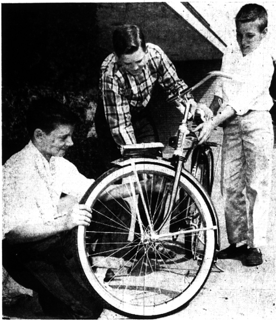
Three On a Bike

Three Vaughan school students look over one of the prizes that will be part of the Vaughan Family Fun day, May 21 at the school. The fun starts at 3 p.m. A chicken dinner is being served by the Big Beaver Methodist Men's club, from 4 to 7 p.m. Prizes include a television set and bicycles.