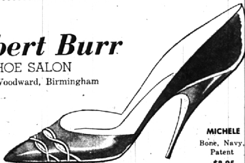
MICHELE Bone, Navy. Patent $8.95

New Footwear Excitement Styled for Spring