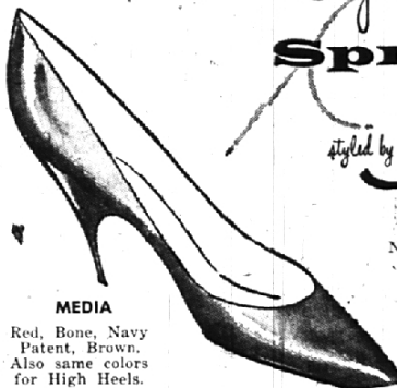
MEDIA Red, Bone, Navy Patent, Brown. Also same colors for High Heels. $16.95