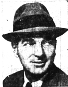
Color and Contrast

Grandma could do it, so can she. But little does she know that the