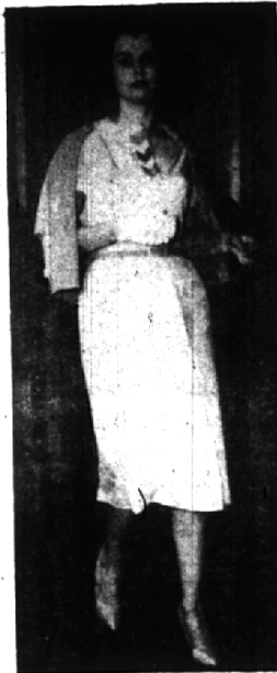
For Casual Wear

Just tlaccz sur le pli en longueur du tissu. Sure, then colocar a lo largo del coblez de tela. Right. And after that, place on lengthwise fold of fabric, cross fingers, cut and sew!