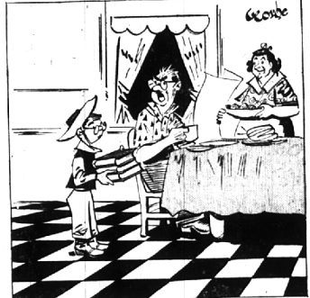
"Look, you . . . everything is going up, including school taxes. Would you try to learn something today?"