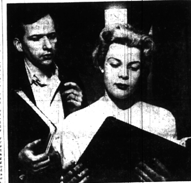
Tiger at the Gates