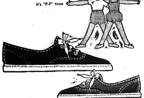
It's "P-P" time

... time for the young crowd's favorite washable play oxfords! Note these comfort features: ventilated uppers, sturdy cushion arches, rigid wedge soles! Navy, red; 4-12 sizes. 3.98 Red, white; 12 1/2-3 sizes. 4.25 White only, 4-8 sizes. 4.98