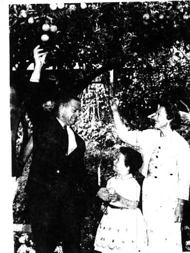
'Pick One for Me'