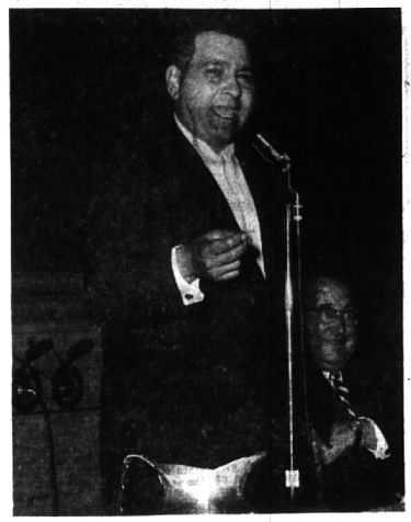
Leaguers Make 'Big Time'