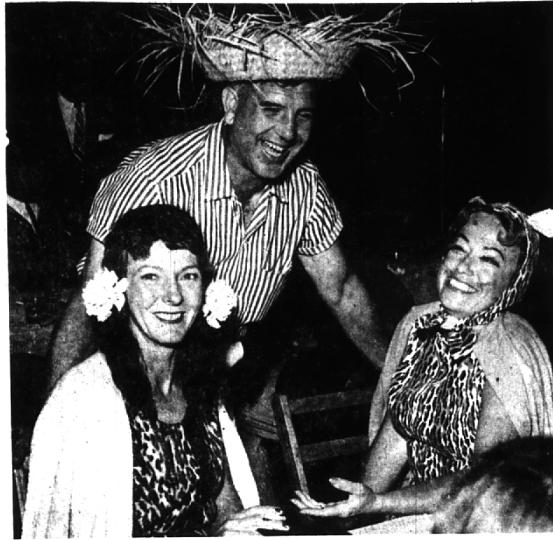
Sitting This One Out