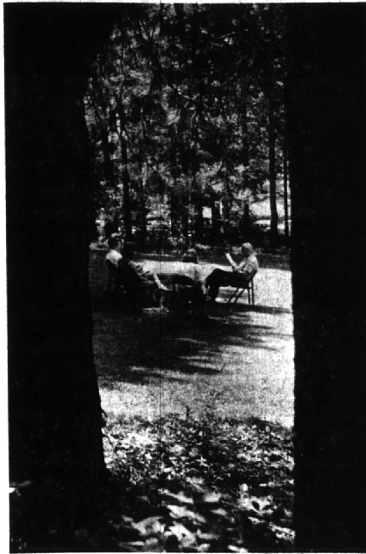
If there's no classroom for you, a quiet meadow will do.