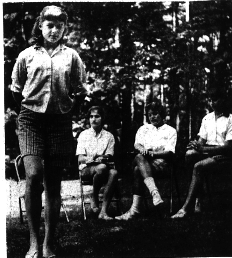
When it's pantomime time, the kids really shine.