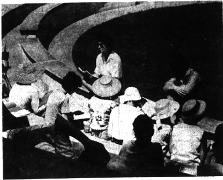
Classes are fun, when you're out in the sun.