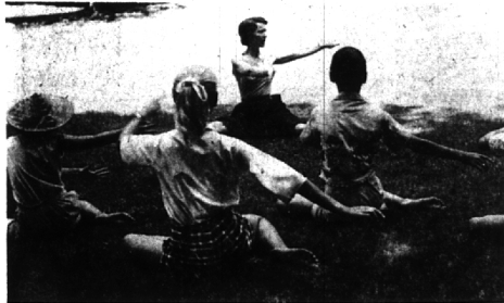
The kids have a chance, to learn how to dance.