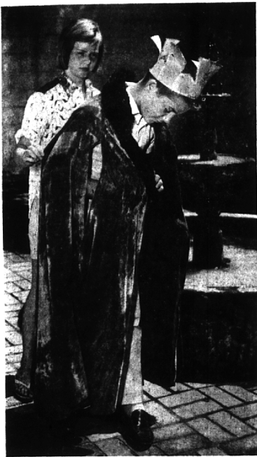
"A little large in the rear, but it looks good from here."