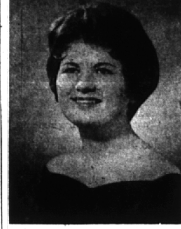
JILL L. EDINGTON

NOTICE OF HEARING ON SPECIAL ASSESSMENT IMPROVEMENTS BY BLOOMFIELD TOWNSHIP BOARD TO THE OWNERS OF THE FOLLOWING DESCRIBED TOWNSHIP LOTS Lots 28 thru 34 inclusive, Lot 36 thru 40 inclusive, Lots 124 thru 133 inclusive of Berkshire Villas No. 3, Section 33, also parcel of acreage known as C-312-A described as: Part of W. 1/2 of SE 1/4 of S. 7292 E. 1/2 of 161.52 ft. th. NW 1/4 E. line of Jackson Park Dr. 844.75 to to corner of Parkstone Lane, th. Ely 1/4 S. line of Parkstone Lane 144.75 to to corner, Lot 75 "Berkshire Villas No. 3", th. S. 201' 10" W. 153.00 to to corner, containing 1.30 acres, Section 33, Bloomfield Township, Oakland County, Michigan. PLEASE TAKE NOTICE that the Township Board of Bloomfield has tentatively declared its intent to make the following described improvements: Grading including a rock concrete pavement and work incidental thereto, on said lots to be assessed as consisting of all the lots and parcels of land hereinabove described. Plans and estimates have been prepared and public examination. The estimated cost of such improvements is the sum of $18,000.00. It is the intent of the Township Board to meet on July 29, 1960 at 7:30 P.M. at the Bloomfield Township Hall, 100 W. 11th Street, Bloomfield, Michigan, for the purpose of hearing any objections to the proposed improvements and to the special assessment district to be created therefor. H. DUDLEY TOWNSHIP CLERK