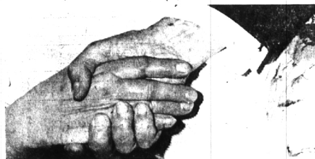
Birmingham residents extended hands of welcome to Sandburg. He accepted them graciously.

But even his bitter criticisms of what we call the modern generation were made palatable when soothed by a sense of humor mellowed by age.