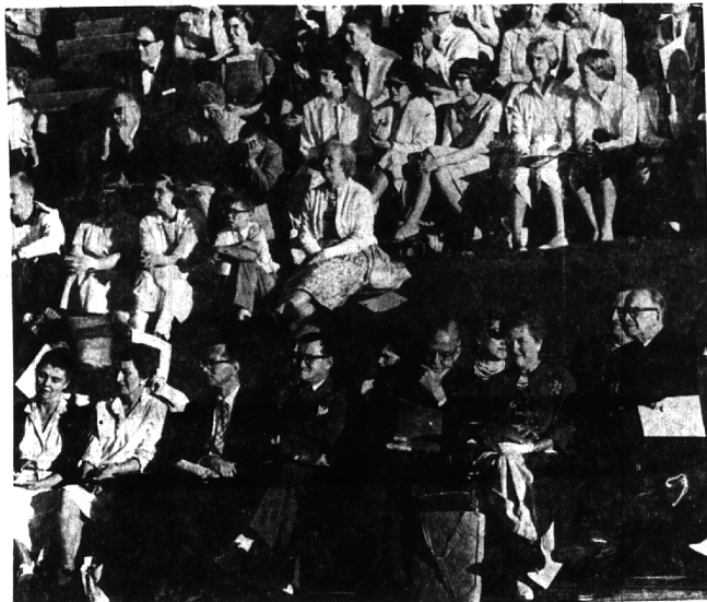
. . . he drew the attention and admiration of the thousands who thronged to see and hear him.