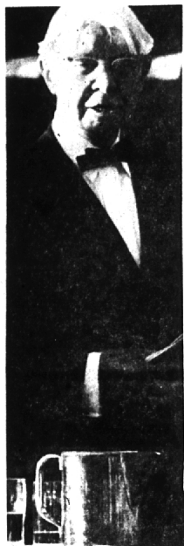
As Carl Sandburg spoke . . .