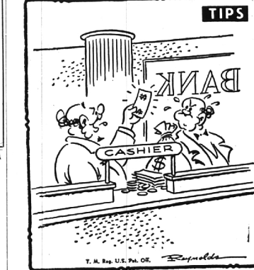
T. M. Rep. U.S. Pat. Off. "Watch for a reward in the Want Ads—I just found a $20 bill!"