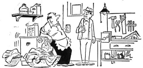
"Then one day she asked if I'd mind if she put her washer in one teeny little corner of my workshop."