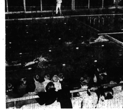
The Maple swimmers monopolized their meet with Mt. Clemens, taking first in all ten events. During the meet one school record was tied and a new pool record was established by the Maple tankers. Seaholm has won three straight meets.