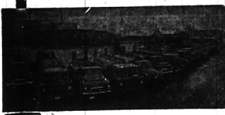
Shown here are some of the Torrance Oil Trucks that are in operation around the clock guaranteeing the finest automotive fuel oil delivery.