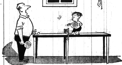
"You're playing too close to the net!"

EPHAM ECCENTRIC Page Thursday, January 14, 1960 5-D known and safer slopes, newer ski techniques and more modern equipment. The leading factor in safe skiing, however, is the skier himself, say the experts. The wise skier observes safety rules and stays within the limits of his skills and strength. Records show most accidents occur late in the afternoon; mainly because skiers are tired, slopes become faster, and growing shadows tend to conceal treacherous spots on the hill. For this reason the Michigan tourist council and the national ski patrol advise: never take "just one more run."