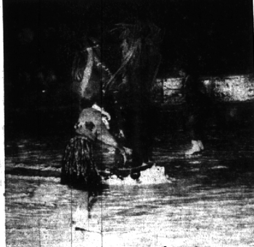
Snow in Hawaii?

The Senior Men's Club was organized in January of 1957. It is co-sponsored by the Birmingham Recreation Board, from whom they also receive great assistance and moral support. Their program for Feb. 26 will include a showing of "Walt Disney's" movie of Switzerland. The Discussion Group which meets separately after lunch will have "Are People So Dumb" for their topic.