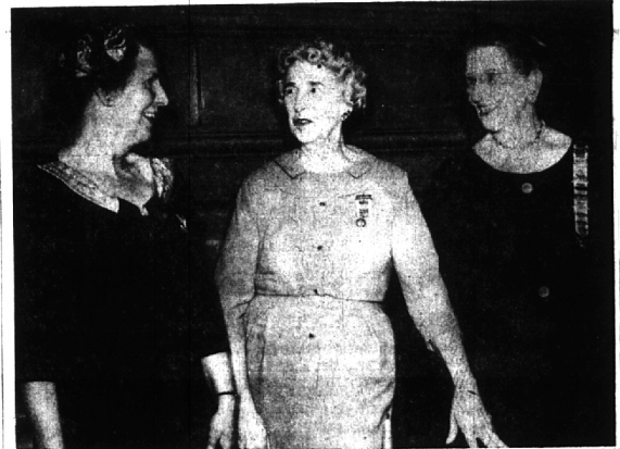
At 25th Birthday Party