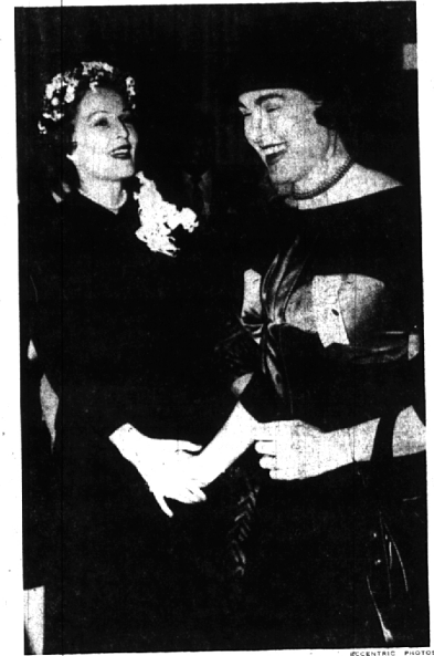
What's the Joke?