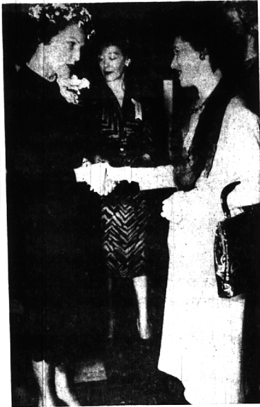
In The Receiving Line