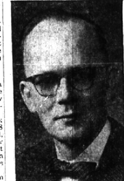
Heads State Press