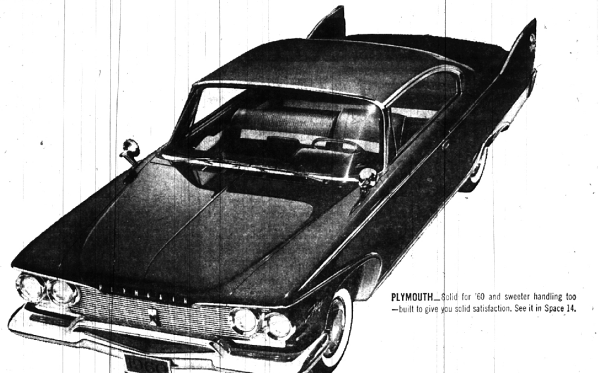
PLYMOUTH...Solid for '60 and sweeter handling too—built to give you solid satisfaction. See it in Space 14.

Cold weather doesn't freeze want ad's fast results.