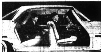
Wide doors you can step through rather than squirm through.

More room inside... without raising the roof or stretching the car