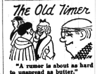
"A rumor is about as hard to unspread as butter."