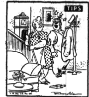
"Did I have fun! The used car I got in the Want Ads has a wolf-call horn!"