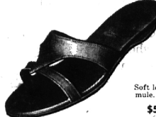
Malibu Soft leather on velvet mule. Good selection. $5 & $5.50