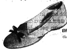
Elfin Corduroy in pink, black and light blue. $5