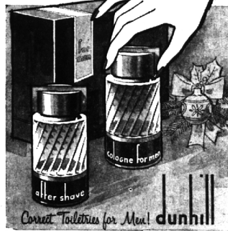
Correct Toiletries for Men! dunhill

The Gift Set of After-Shave and Cologne, 3.00, 5.00 and 8.50. All prices plus tax.