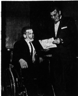
He Achieves a 'First'