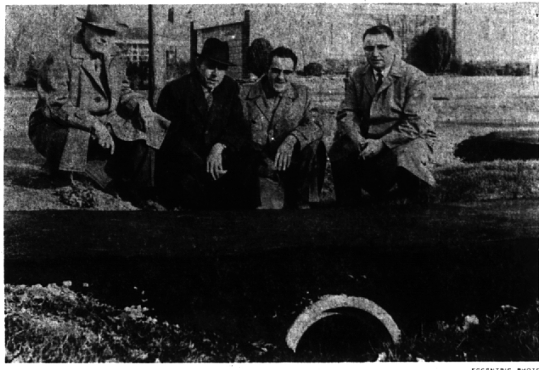
Now It's No Feat... to Cross the Street

THE ENGINEERS are expected to make a report and recommendation for bid award at the regular meeting of the council, Monday evening. The court-set deadline for bid is Dec. 15.