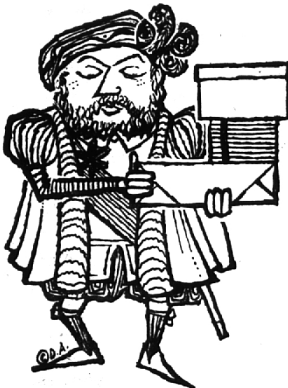
Henry VIII shopped in London

BLOOMFIELD PLAZA—TELEGRAPH AT W. MAPLE Birmingham, Michigan Mayfair 6-5933