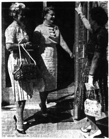
'Modes for Milady'