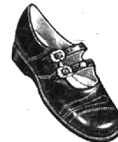
The two strap with a welt sole gives good support and long wear.