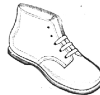
Baby needs new shoes too and we have the finest for little feet just starting to travel on their own.

Specialists in the proper fit of children's shoes.