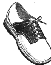
Saddles are still the finest choice. We have a wide variety of patterns and colors too.