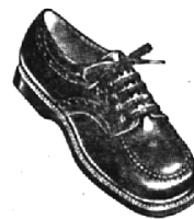
Boys oxfords and loafers in Brown, Black and Buck. In Grey and Loden Green. Some with shark tips for hard wear.