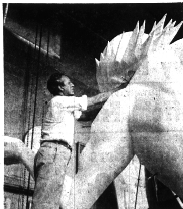
Eccentric

With all of the other steps behind him, the sculptor now works on the final product, the full-sized object. First a clay model is made, one in plaster of paris, then one in the permanent form (such as bronze).