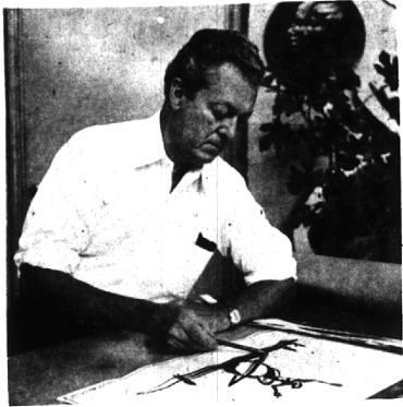
He Starts To Work