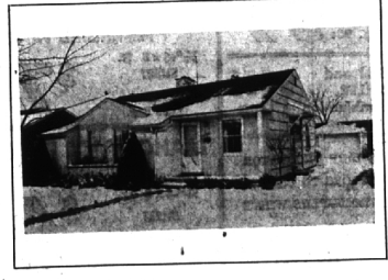
EARLY AMERICAN INTERIOR, IN BEVERLY HILLS Appealing when framed by either snow or summer shrubbery. 3 Bedrooms, porch, dining el, fine kitchen. An immaculate home, proudly maintained. $17,500.