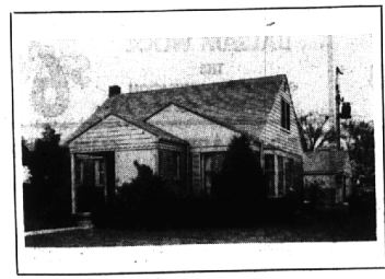
EXTRA SPACE, ON A BIG CORNER LOT 3 Bedrooms, 2 full baths, second floor sewing room. Large bay, full basement, two car garage. $20,500 with FHA terms available.