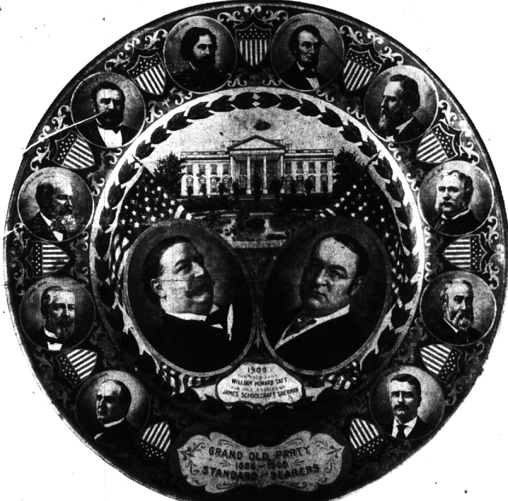
Stove Pipe Cover Candidates

A picturesque and tiny item used in the campaign of 1888 is this glass-enclosed picture of Levi Parsons Morton who ran for vice-president with Benjamin Harrison. Usually only the president's likeness was used in tokens of this type, making this a rather rare political memento which could be worn as a watch fob.