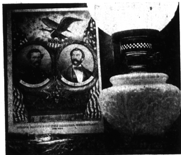
Currier & Ives Banner