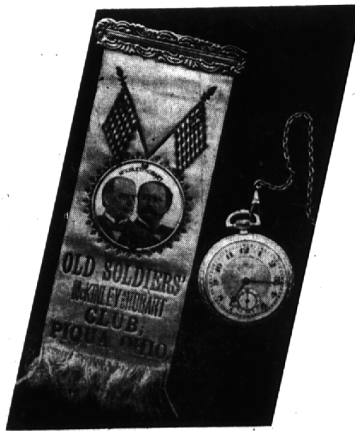
Full Dinner Pail

Currier and Ives were commissioned by many political parties to prepare campaign "banners" as early as the 1844 contest. John Charles Fremont, first Republican candidate in 1856, is shown here in his 1864 try against Lincoln. His running-mate was John Cochrane and their party was the Radical Democrat.