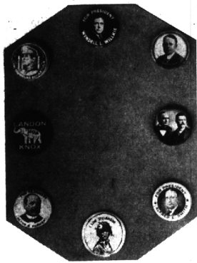
Pin Your Man

Celluloid and metal pins came into common campaign use late in the last century. Their use in presidential campaigns does not always wait upon the conventions as in the case of General McArthur who was considered a possible nominee for the Republicans in 1952. The latest pin pictured here at the bottom is that used by Stevenson supporters and contrasts with that of McKinley and Theodore Roosevelt, directly opposite the Landon-Knox badge.